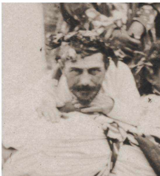
(2) Paul Gauguin in Tahiti, July 19, 1896

The first Agostini album was preempted by the French Government for the MQB, the second – now mine – was allowed to leave the country.