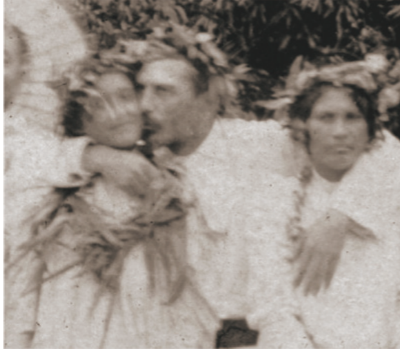
(1), Paul Gauguin with Two Women in Tahiti, July 19, 1896