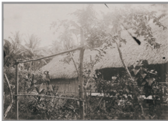
The House of Paul Gauguin in Tahiti, 1896

I knew that „our“ photo was in there as well as an additional one showing Gauguin in a different posture, plus the famous one of his house in Tahiti.