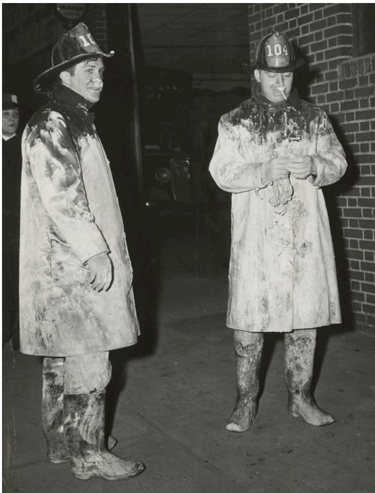
Weegee (1899 - 1968)