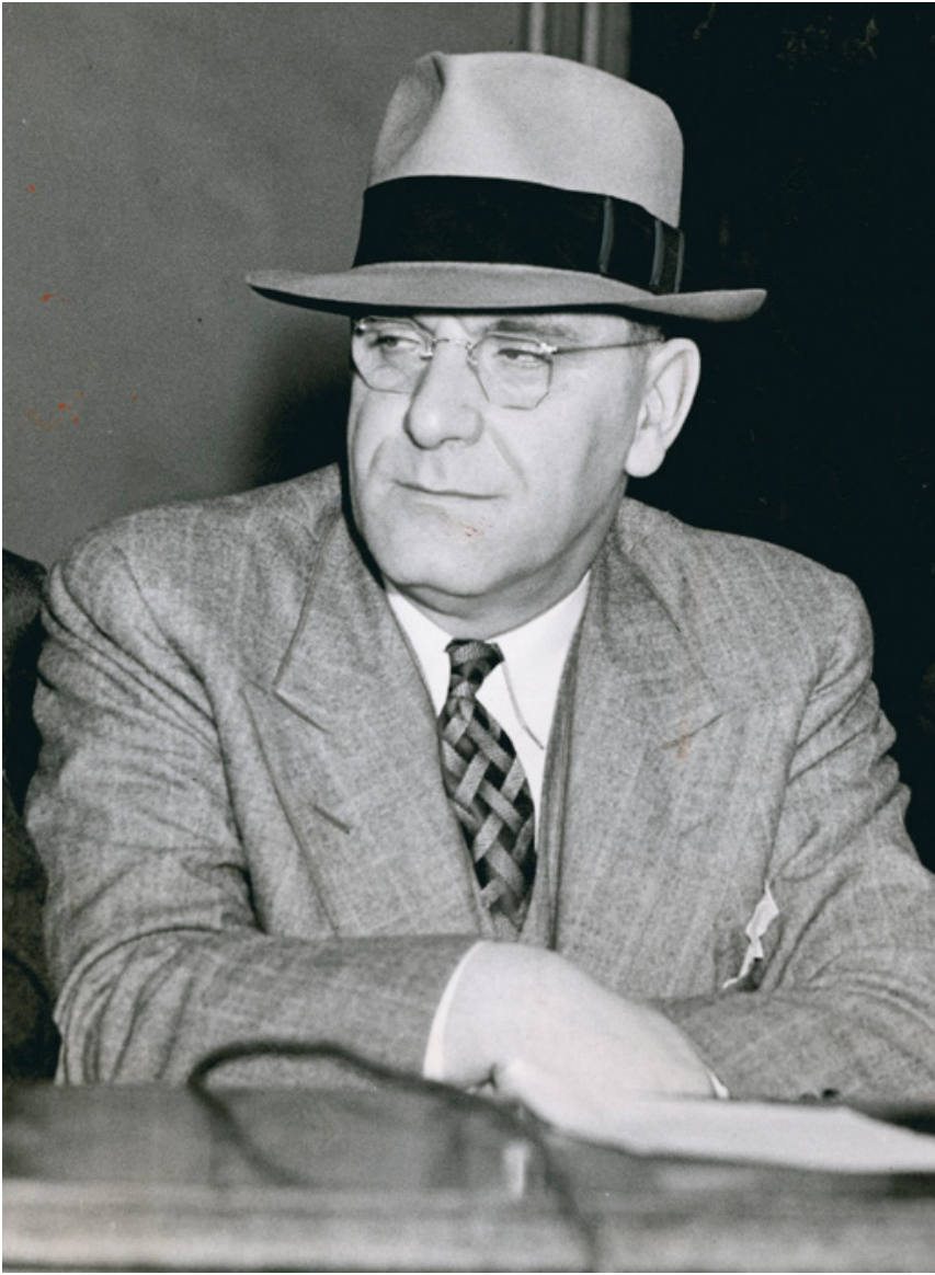
Weegee (1899 - 1968)

"Bund Leader Booked on Theft Charge", May 26, 1939, silver gelatin print on glossy fibre paper; printed by July 19, 1939 19,1 (20,8) × 14,1 (15,3) cm