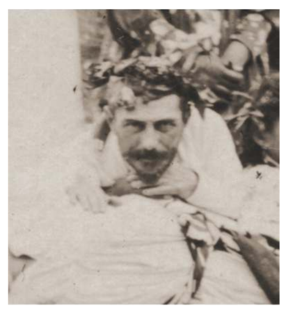
(2) Paul Gauguin in Tahiti, July 19, 1896

The first Agostini album was preempted by the French Government for the MQB, the second – now mine – was allowed to leave the country.