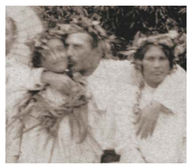
(1) Paul Gauguin with Two Women in Tahiti, July 19, 1896