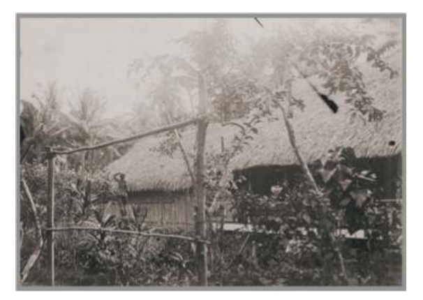
The House of Paul Gauguin in Tahiti, 1896

I knew that ,,our" photo was in there as well as an additional one showing Gauguin in a different posture, plus the famous one of his house in Tahiti.