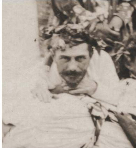
(2) Paul Gauguin in Tahiti, July 19, 1896

The first Agostini album was preempted by the French Government for the MQB, the second – now mine – was allowed to leave the country.