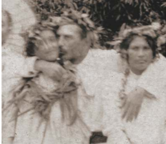
(1) Paul Gauguin with Two Women in Tahiti, July 19, 1896