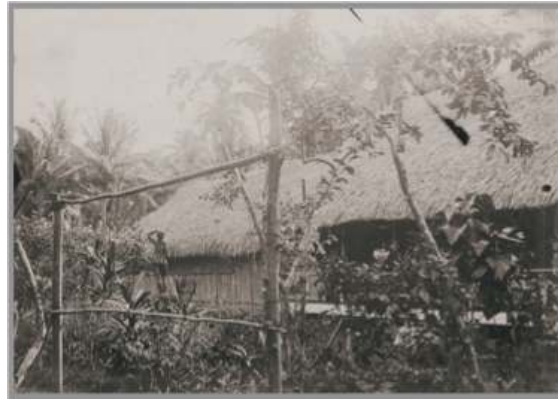
The House of Paul Gauguin in Tahiti, 1896

I knew that „our“ photo was in there as well as an additional one showing Gauguin in a different posture, plus the famous one of his house in Tahiti.